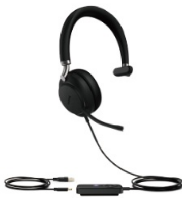
UH38 Mono Teams-W/O BAT UH38 Mono UC-W/O BAT